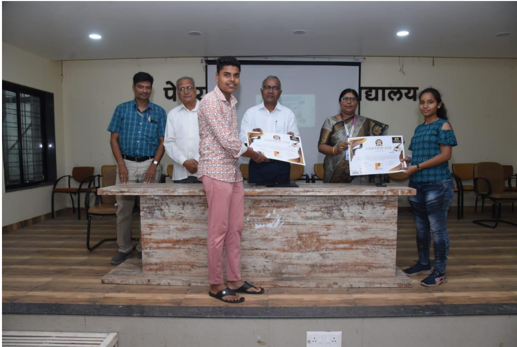
Sample Copy of the Certificate