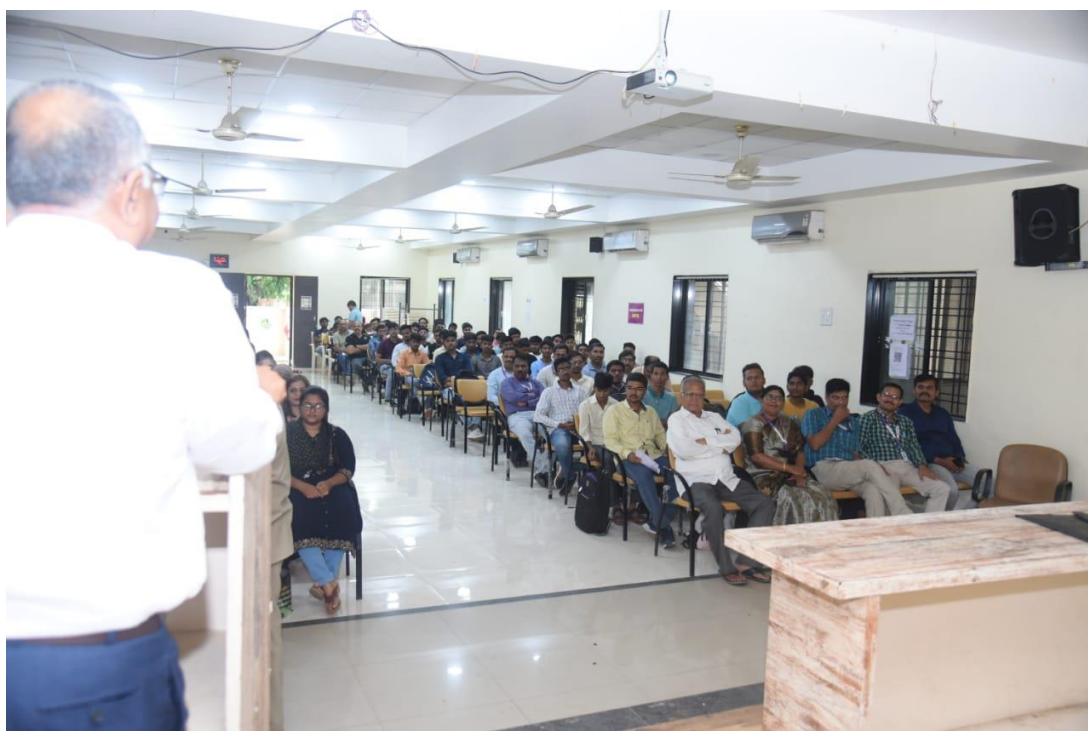
A proud moment for student participants, showing off their Certificates